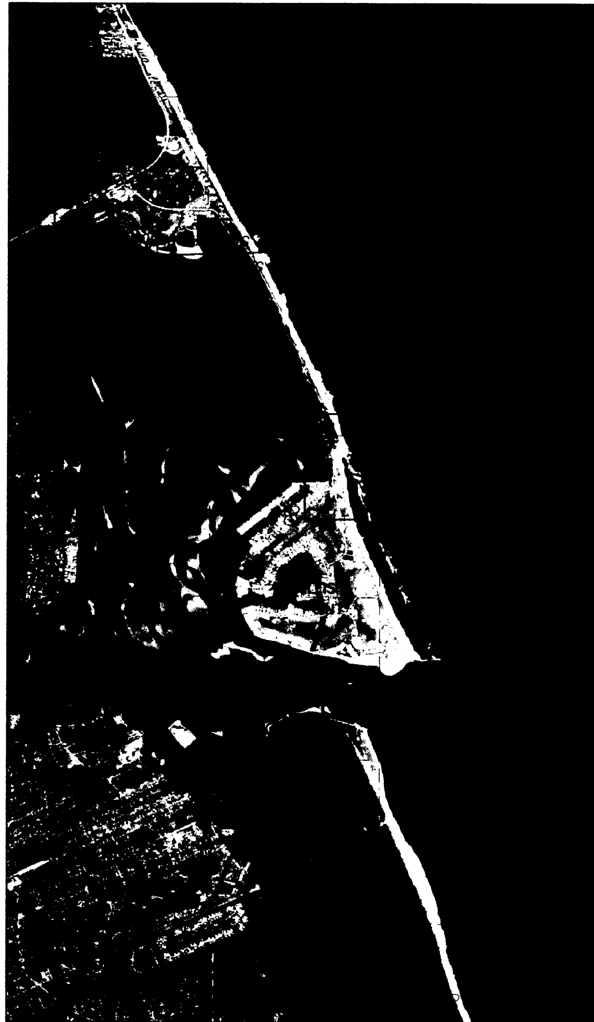
LOCATION MAP 1" = 3,000 FEET